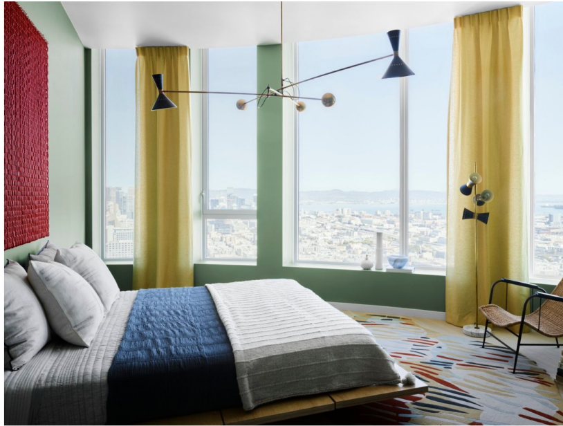
A bedroom in a sample model unit at Fifteen Fifty. It is similar to the one recently rented.