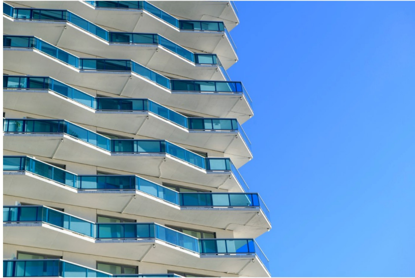
The Beach in Newport, Jersey City, N.J.