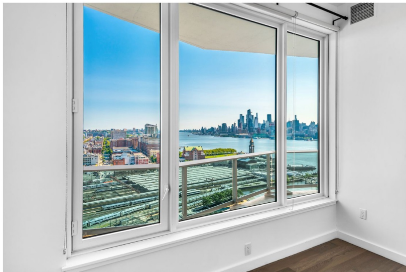
The view from a unit that recently rented for $10,995 per month at The Beach

Located in the mixed-use community of Newport in Jersey City, one of The Beach's penthouse units, which recently rented, has four bedrooms, four bathrooms and is 2,403 square feet. The penthouse also has a 745-square-foot wraparound terrace. The kitchen has quartz countertops, GE Appliances and a Moen pull-down faucet.