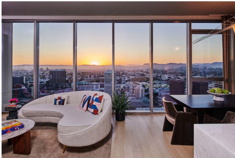
The Grand by Gehry model unit

With three bedrooms and two bathrooms, an apartment currently for rent located within the Frank Gehry-designed complex, The Grand LA, in downtown Los Angeles, is 1,638 Square feet and has 9-foot ceilings. It has an open kitchen with white stone countertops, Blue Fusion quartzite slab backsplash, oak cabinetry and soft-close drawers.