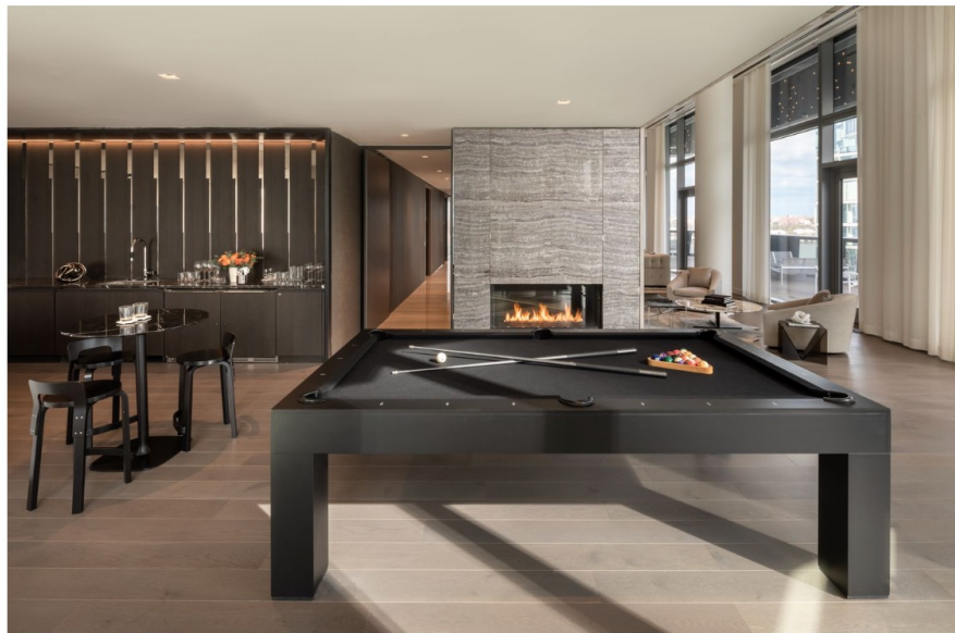
Amenities at Waterline Square

A two-bedroom, two-bathroom apartment that was recently rented in this complex is 1,235 square feet. It has an open kitchen with a waterfall island, wine refrigerator, fully vented range hood, waste disposal and a Bosch-designed appliance package.