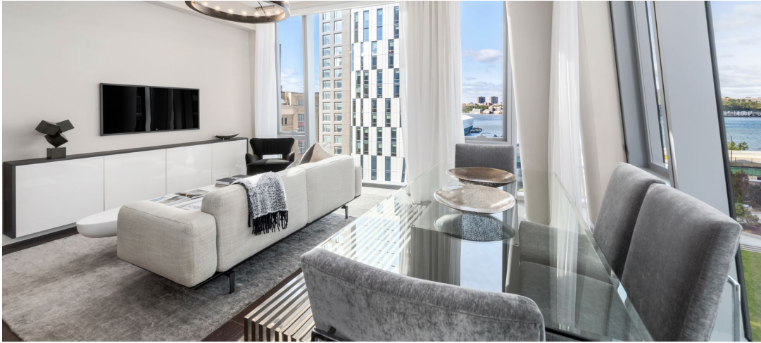
A model apartment that shows what around $10,000 per month will get tenants at Waterline Square in Manhattan