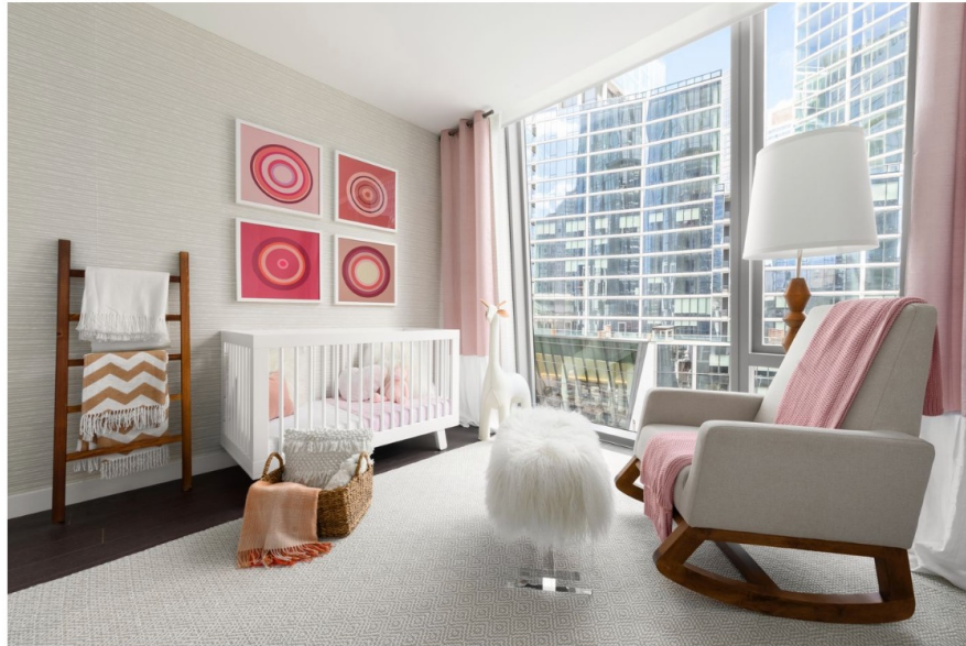
A Waterline Square model unit that is similar to the one recently rented.