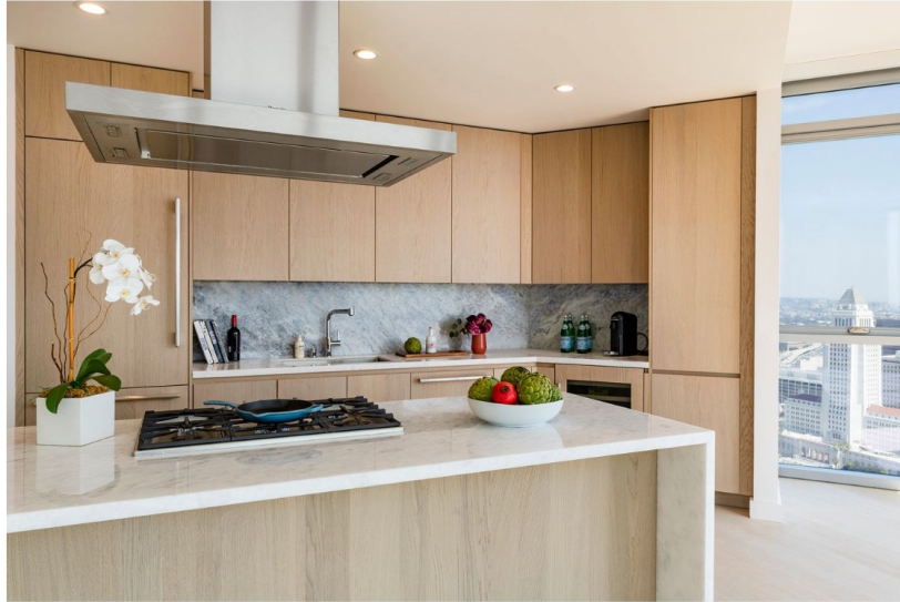
This photo is of a model unit that would rent for more than $10,000 a month at The Grand by Gehry